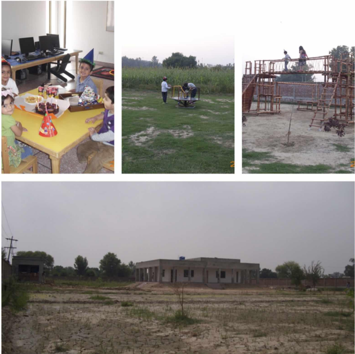
Fig: The bottom photograph was taken in August 2012. The top three photographs were taken in October 2012.

The School was closed in January 2013, and construction began. The School was designed to be harmonious with nature, while providing ample sports opportunities for children. The construction carried many idiosyncrasies. The two notable mentions are: